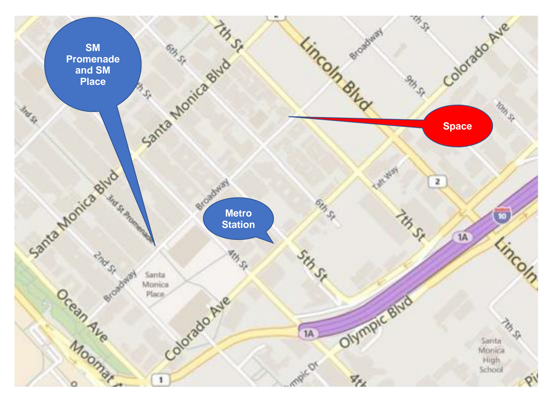
Broadway is one the main gateways to downtown Santa Monica, SM Promenade & SM Place

Space has huge exposure on Lincoln, Broadway and from the Vons Parking across the street Broadway has a bike Path; Santa Monica City Fiber Band Network available on Broadway